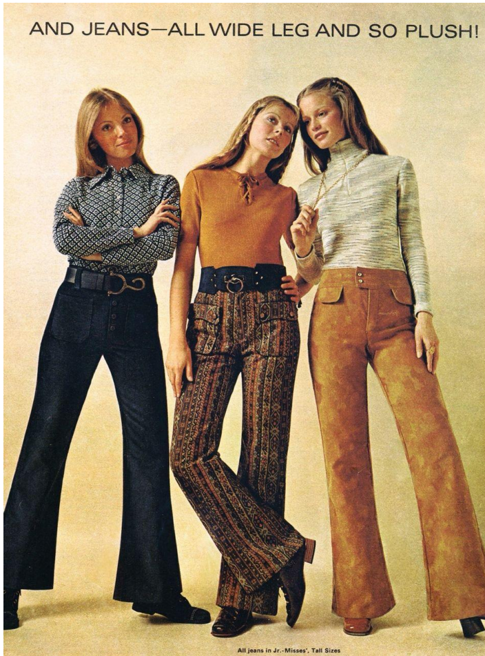
All jeans in Jr.-Misses', Tall Sizes