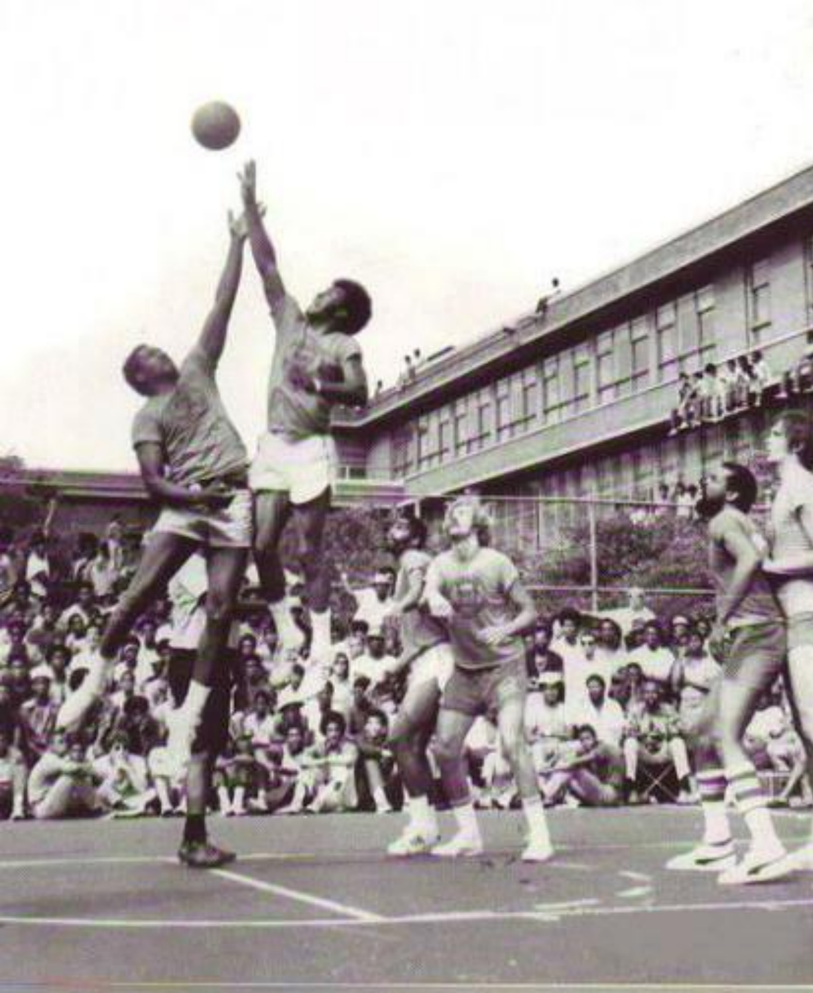
Earl “The Goat” Manigault