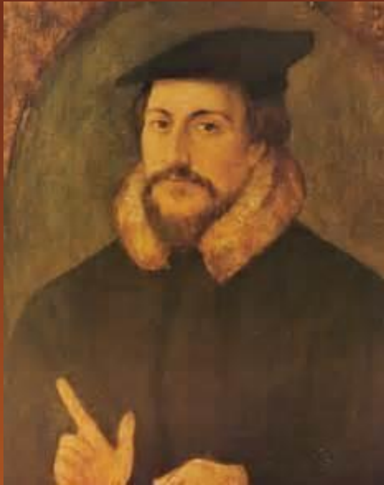
John Calvin 1509 - 1564