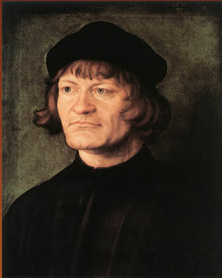
Ulrich Zwingli 1484-1531