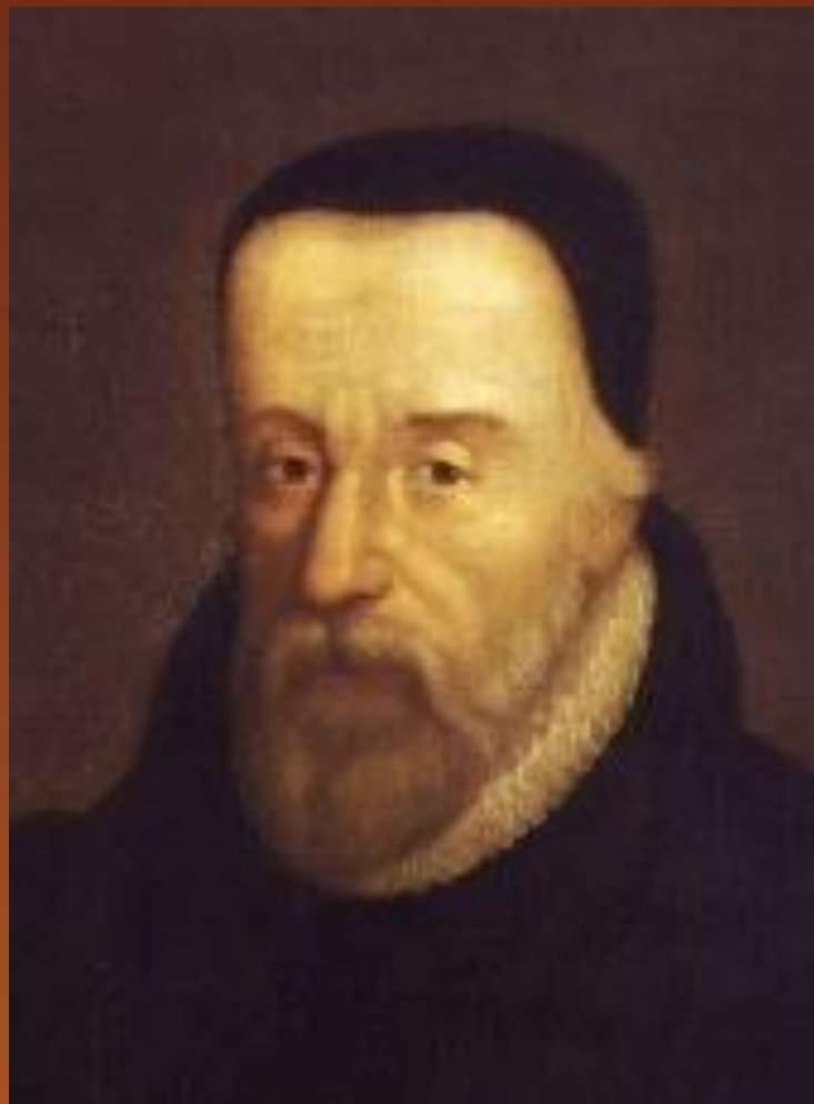
William Tyndale 1494 - 1536