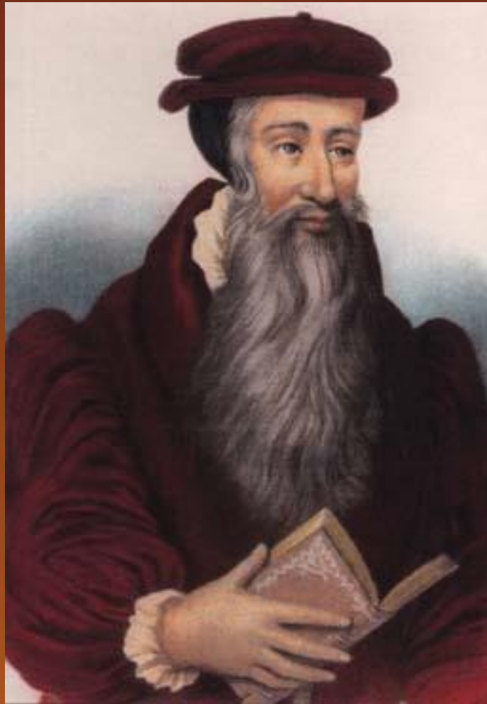
John Knox 1514 - 1572